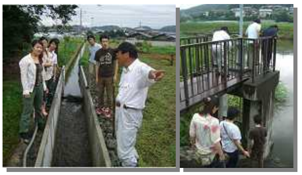
Trainees are lectured about the land improvement district

The non-profit organization "Nature School Terakoya" has been working enthusiastically on a variety of activities as part of its mission to leave important natural resources globally for future generations based on the principles of coexistence. The supplementary technical training for JOCV volunteers is one of the meaningful activities that the Nature School has been implementing on a continuous basis. participants in the training for the rural development volunteers. Their assigned countries range from Uganda and Kenya to Bolivia. All the volunteers are due to be working on water use and management issues in the farming community. The training theme was set as "water management". The 2-week training program took into consideration the reality that many participants never had a chance to experience agriculture or irrigation. Given this, it included a field visit to farmers in the Kanra-tano land improvement district, and practical sessions, with assistance from local people using the Nature School's network.