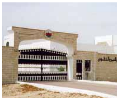
Facility for the physically challenged in Salalah

This type of interaction between AAI and the local people in Oman has just started, and due to time constraints not enough interaction has been achieved yet. However, we believe that it is important to keep trying and continue the interaction in order to understand the local people and their needs better and eventually to contribute to solving the problem of environmental conservation and vegetation rehabilitation in this area. There is a rich tradition of strong communal sense and mutual support among the people in Oman. Drawing upon such culture, we are trying to promote regional environmental conservation through collaboration with the local community in various aspects, by linking children's education, rehabilitation of the handicapped and women's empowerment with plantation and other environmental activities.