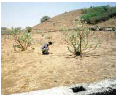
Mountain landscape in the dry season