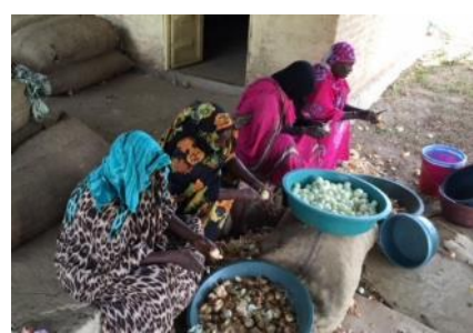
Peeling by village women

It has already been a year and a half since the project started, and NOTA has been conducting steady efforts in the Meanwhile, the