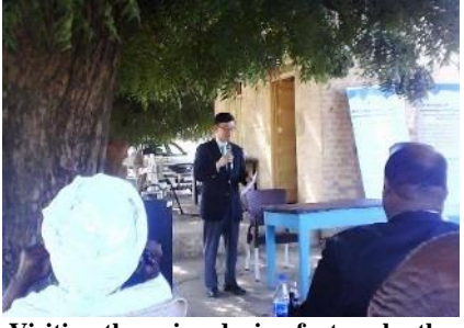
Visiting the onion drying factory by the then Japanese ambassador in Sudan

mountain village Oita Prefecture. Based on that experience and discussions with NOTA, I got a specific picture that it would be