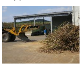
Sugarcane collected in a sugar

Because it was a great opportunity for me, I asked a farmer who owned the guest house where I was staying if I could experience sugarcane harvesting. The harvesting has become a little easier by using a machine called a "barikan (clipper)", that cuts from the cane base. But in