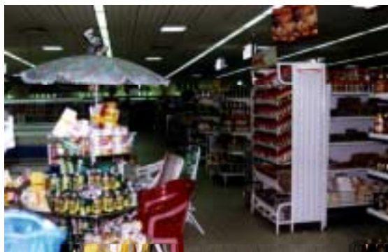
Modern supermarket in town