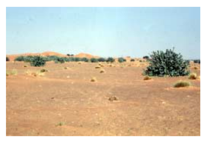
Wadi near the dune area