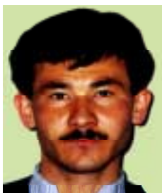
Hazara (hotel employee)