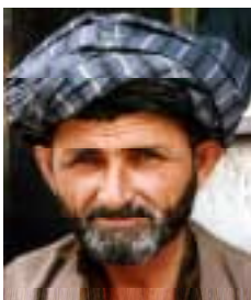
Pathan (watch seller)