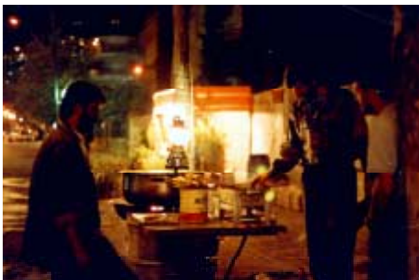
Stands of boiled maize in Damascus